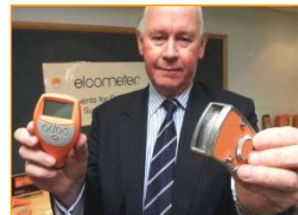
The digital Elcometer 456 (left) developed from the original "Elcometer" (now 101), which had no electrical parts.

For further information on the Elcometer 101 or any of the coating thickness gauges available from Elcometer, visit www.elcometer.com or contact your local distributor.