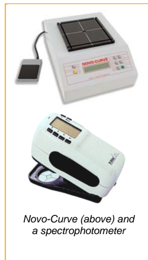
Novo-Curve (above) and a spectrophotometer

The appearance of the final assembly is very important for the purchaser. It is also important for parts that were made at different times in different places or conditions and brought together into one assembly. Any variation in gloss will appear as a change in colour, even when the coating is 'the same', so measuring gloss before this stage will avoid rejections. The Elcometer 400 Novo-Curve Glossmeter measures the specular gloss on curved and narrow shapes as well as on flat panels.