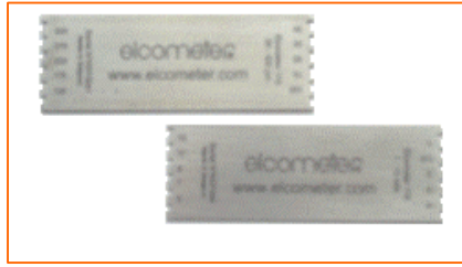
Elcometer 115 Wet Film Combs

These reusable precision stainless steel combs are made to be long lasting.