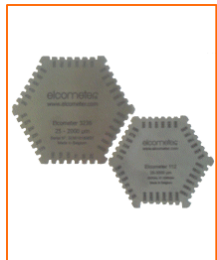
Elcometer 112 & 3236

These stainless steel combs are wire eroded to provide an accuracy of \pm 2.5\mu\text{m} (0.01mil) and are supplied with either Metric or Imperial measurements.