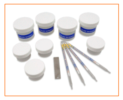
Elcometer 134A Chloride Ion Test Kit for Abrasives