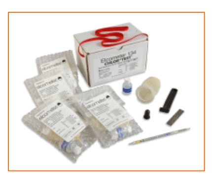
Elcometer 134S Chloride Ion Test Kit for Surfaces