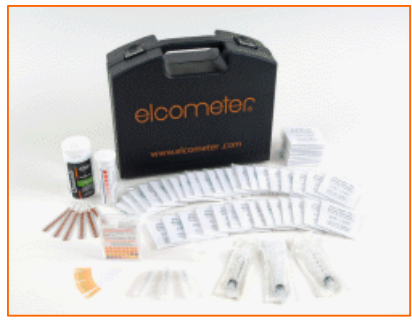
Elcometer 138/2 Surface Contamination Kit