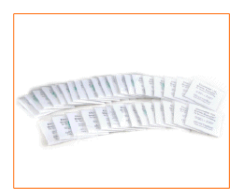
Elcometer 135A Bresle Sampler

Supplied with the Elcometer 138/2 Surface Contamination Kit, the Elcometer 135A is a self-adhesive rubber film patch with a sealed compartment used for taking samples of soluble impurities on a test surface.