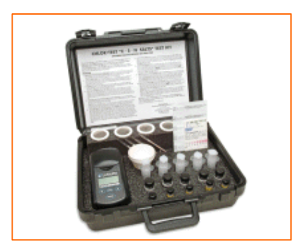
Elcometer 134 CSN Chloride, Sulphate & Nitrate Kit

Chloride salts left on the surface before the first coat is applied can result in the coating system being forced off the surface by corrosion or blistering before the full life of the coating has been reached. To ensure that the chloride has been removed, it is essential that the surface is tested before the coating is applied.