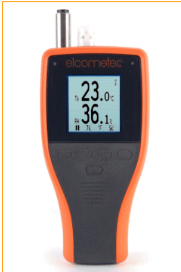
Elcometer 308 Hygrometer