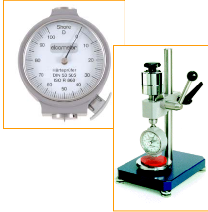
Elcometer 3120 Shore Durometer

The Elcometer 3120 range of durometers is widely used to test the hardness of soft materials.