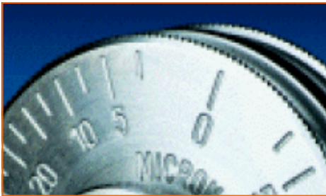
Elcometer 3230 Coil Coating Wet Film Wheels